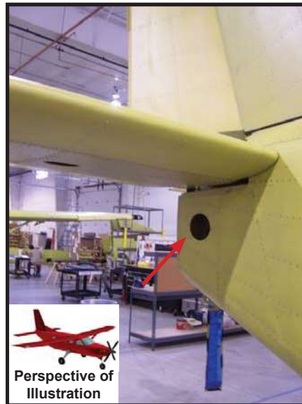
Figure 1-1 Elevator Control Access Panel

NOTE: Figure 1-1 illustrates the right side of the aircraft.