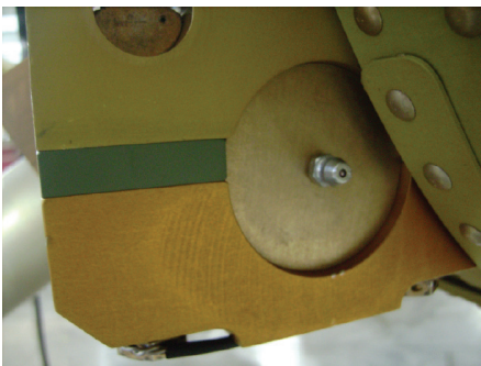
Figure 1: Main Landing Gear Grease Fitting

This modification is warranty reimbursable for the manpower listed above after Quest Aircraft has been notified of your completion.