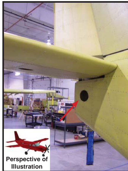
Figure 1-1 Elevator Control Access Panel

NOTE: Figure 1-1 illustrates the right side of the aircraft.